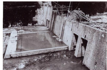
Fig. 3 Under construction