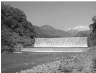
Fig. 1 Hongu Sabo Dam

The Hongu Sabo Dam is a large check dam that was constructed in the middle reach of the Joganji River, one of the steepest rivers in Japan (The average bed slope is about 1/30). The dam is 22.0 m high, has a crest length of 107.0 m, a volume of 37,000 m 3 , and a sediment trap capacity of 5million m 3 , the largest in Japan. In recent years, improvements have been made to enhance the environment around the Hongu Sabo Dam, which was made in the days before mechanized equipment. To save cement, the front and crest of the dam were made of stone, and rubble concrete was used inside the dam ( Fig.2 ). The construction of the Hongu Sabo Dam required large tower cranes and chutes, and rubble concrete, which were state-of-the-art equipment, materials, and methods of the time ( Fig.3 ). Despite its size, the dam was completed in less than 2 years.