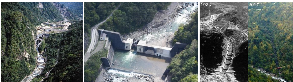
Shiraiwa Sabo Dam ; Nationally designated important cultural properties