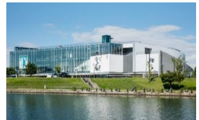
Toyama Prefectural Museum of Art and Design

We will visit the world heritage "Gokayama Ainokura Gassho-style Village" (steeply-pitched thatched roofs unique to heavy snowy areas), the national treasure "Zuiryu-ji Temple" (Zen temple architecture of the 1600s), Toyama Prefectural Museum of Art and Design which opened in August, 2017 exhibiting