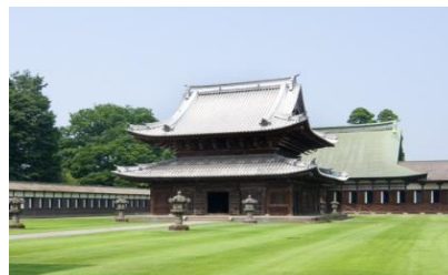
Zuiryu-ji Temple ; National Treasure