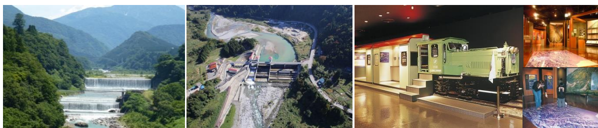
Hongu Sabo Dam ; National Registered Tangible Cultural Properties