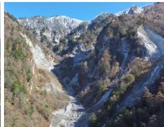
Series of Sabo dams in Shiratani Valley