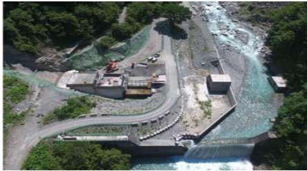
Kuronagi-River No.2 Downstream Sabo Dam (under construction)