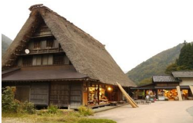
Gokayama Ainokura Gassho-style Village ; World Heritage (UNESCO)