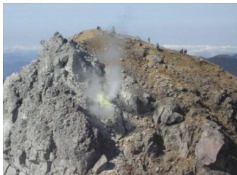
Mt. Yakedake (active volcano)