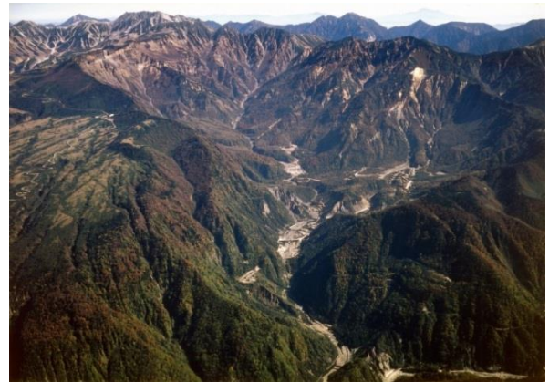
Panoramic view of Tateyama caldera

I . Purpose: Disasters associated with seismic and volcanic activities which are peculiar to orogenic zones occur frequently in the whole Pacific Rim. In addition, catastrophic sediment disasters caused by heavy rains and big typhoons are occurring increasingly in recent years as a result of climate change. People in the orogenic zones had to live with disasters exerting desperate efforts to mitigate the impacts of such disasters. Technologies for disaster mitigation developed under such circumstances over a long time in the past should be regarded as the world heritage of mankind to be inherited for long in the future.